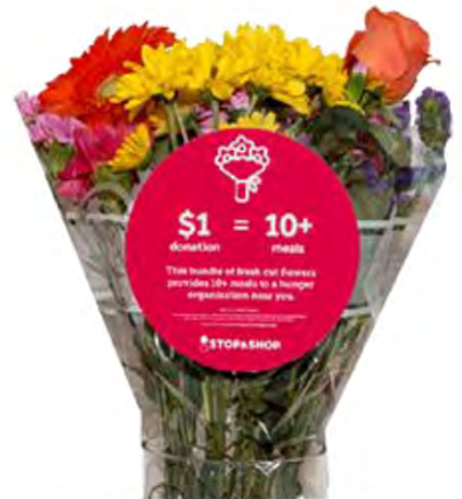
$10.99 Bloomin' 4 Good Bouquet

Butler United Methodist Church Loaves and Fishes Food Pantry is a non-profit based in Butler NJ. Loaves and Fishes works to alleviate hunger in our local community.